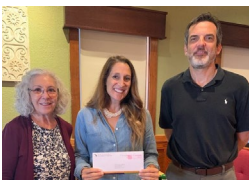
Congratulations to the KC of St. Augustine on their Wil & Rachel Blechman grant award for the Books for Brandt’s preschool First Readers program