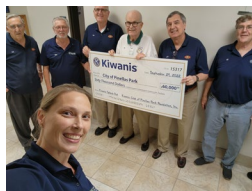
KC of Pinellas Park presents check to the City of Pinellas Park for the Kiwanis Splash Pad project