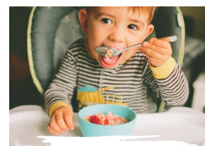
Supporting Florida Children & Families Hurricane Ian Relief