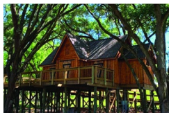
Kiwanis Clubs of North Lakeland and Citrus Center Kiwanis Cares for Kids Treehouse